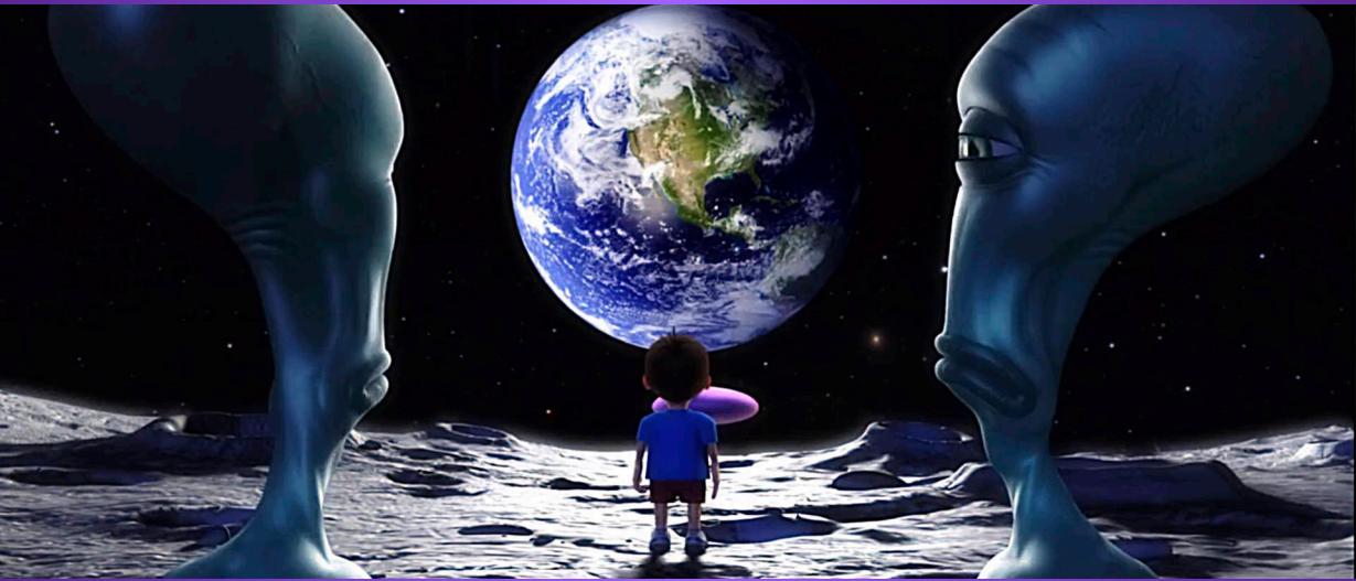
Out Of This World - Award winning bubblegum commercial