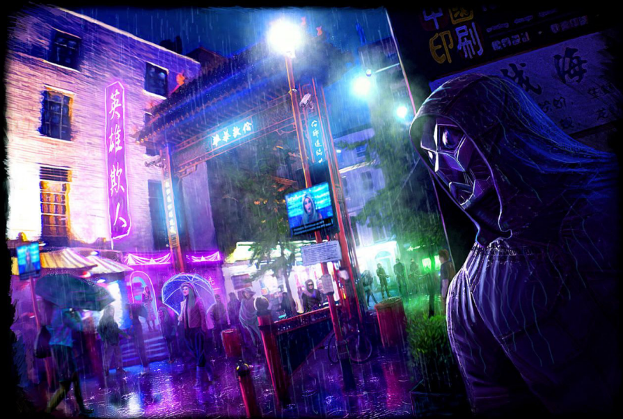
Concept art from The Talos Project Cyberpunk Web Comic